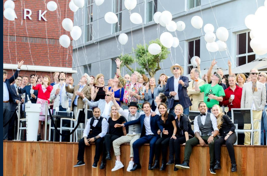
TERRACE BAR SPARK