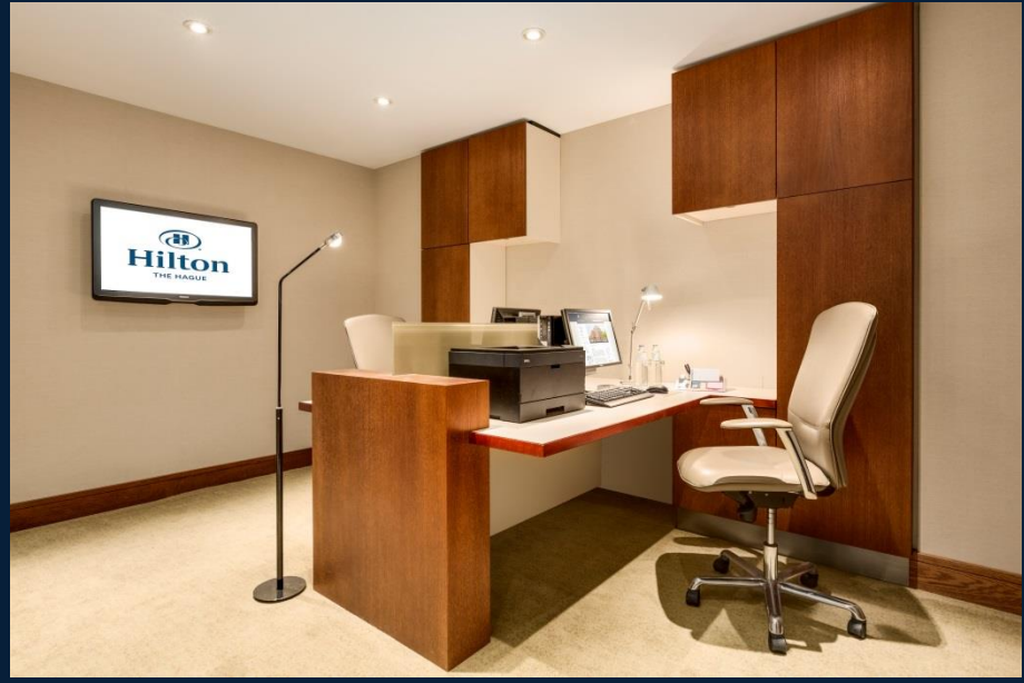
UPPER LOBBY | BUSINESS CENTER | DEDICATED HILTON MEETING HOST