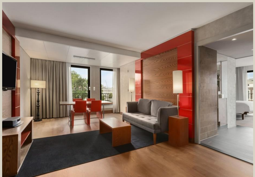
ONE BEDROOM SUITE