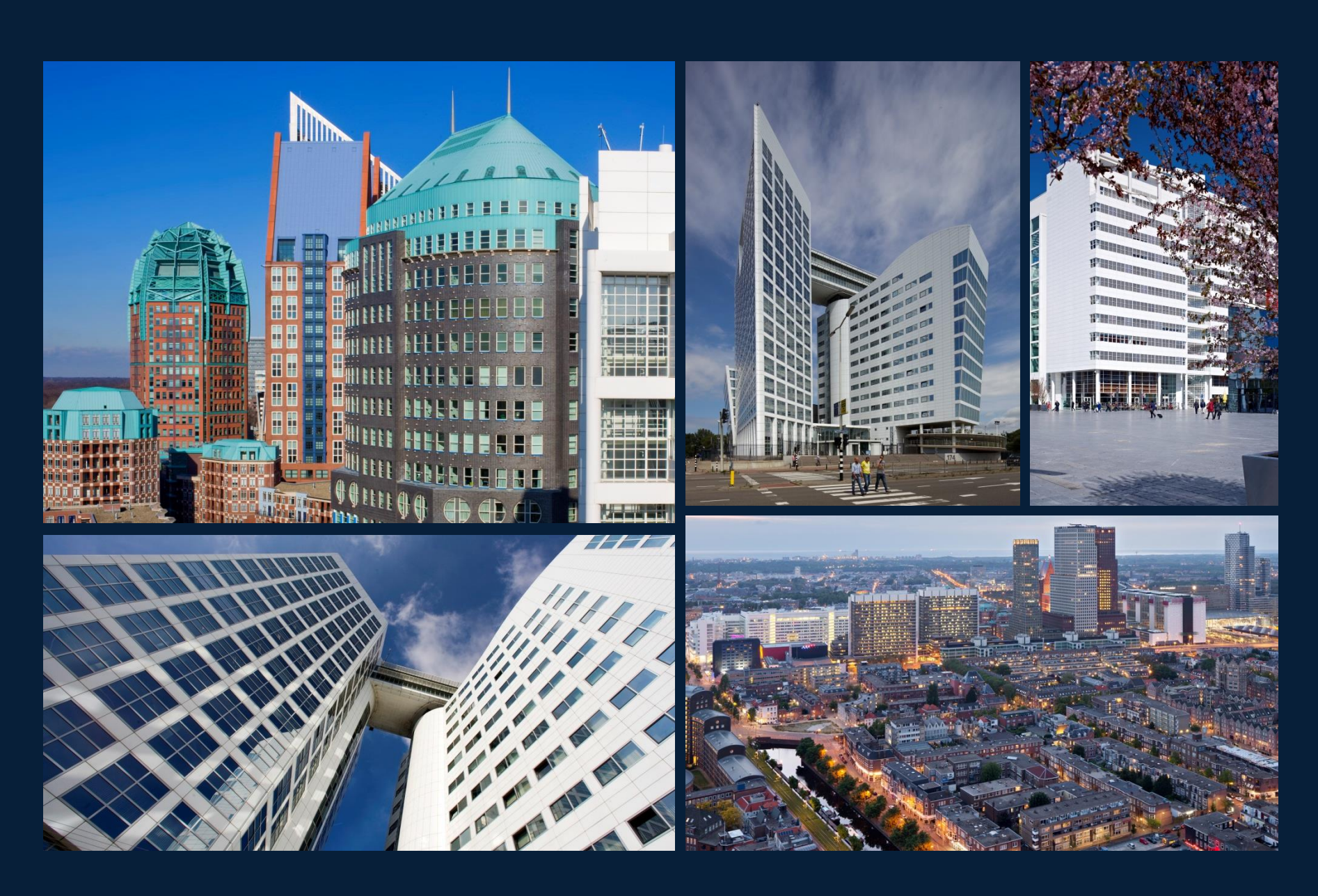
Hilton The Hague is close to the important business areas in The Hague.