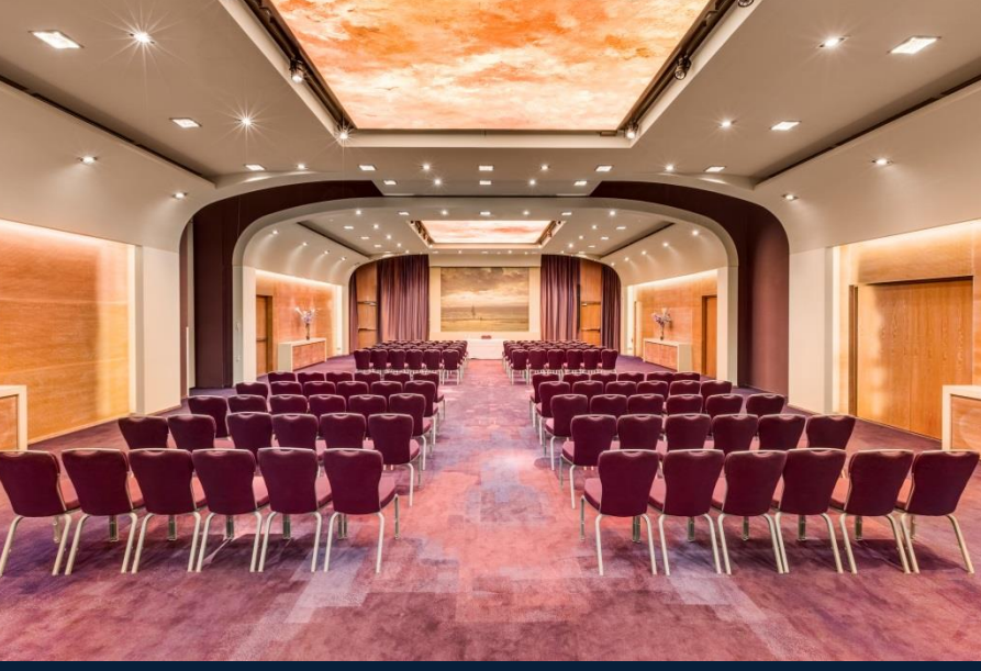
BALLROOM THE MESDAG